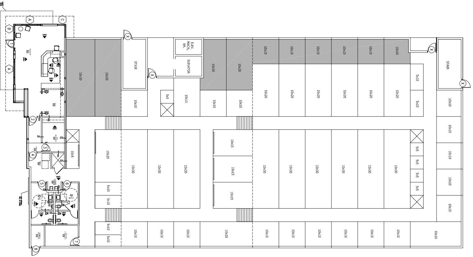
1 BUILDING '1' FIRST FLOOR PLAN SCALE: 3/32" = 1'-0"